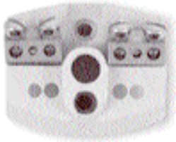
1018A Single Terminal Block (2 Terminals) Order 1018A