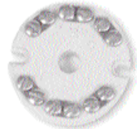
1018C Triplex Terminal Block (6 Terminals) Order 1018C