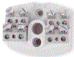
1018B Duplex Terminal Block (4 Terminals) Order 1018B